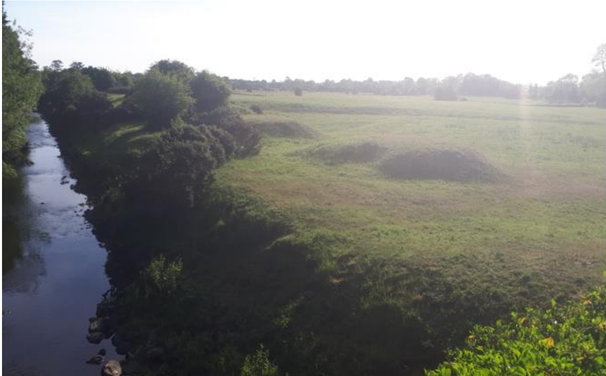
Photo 1: Straightened and deepened section of the Blackwater headwaters (top of BLACKWATER (LONGWOOD)_010 waterbody.