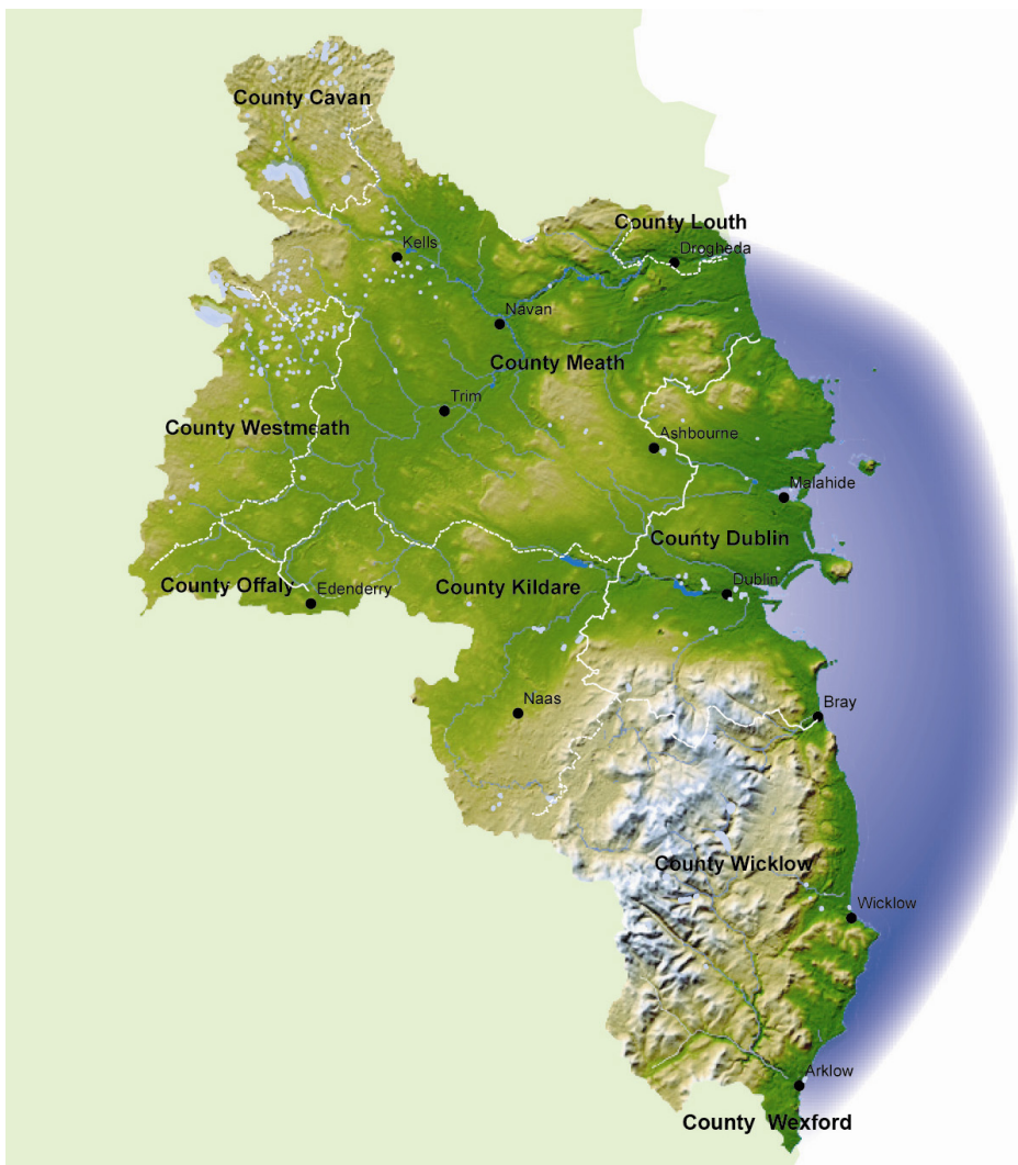
Figure 2.2 Eastern River Basin District